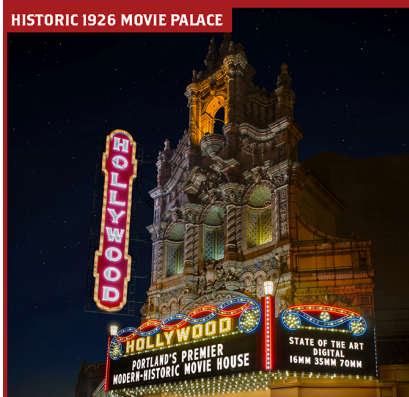
HISTORIC 1926 MOVIE PALACE